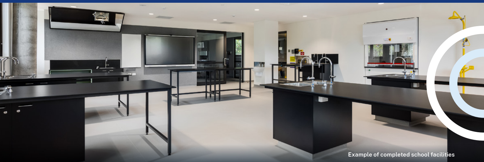
Example of completed school facilities